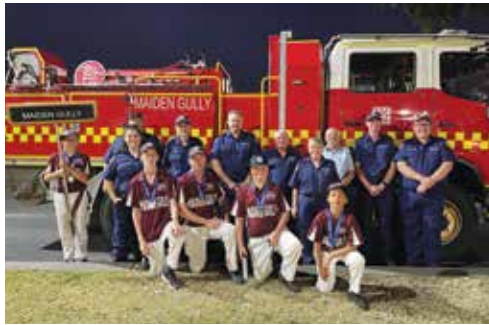
Photo: Brigade at Easter Torchlight Parade.